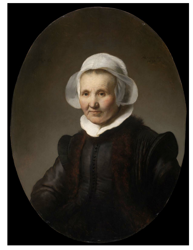
Figure 1. Rembrandt Harmensz. van Rijn, Portrait of Aetje Uylenburgh, 1632. Oil on panel. Promised gift of Rose-Marie and Eijk van Otterloo, in support of the Center for Netherlandish Art, Museum of Fine Arts, Boston.

collaboration with the Museum's curators and conservators; and convene periodic conferences, seminars and lectures that will be open to the academic community and the general public. Utilizing the strengths of the MFA, the CNA will present public programs that encourage visitors to discover connections and relevance in Netherlandish art and culture. In addition, a robust program of loans and traveling exhibitions will enable the MFA to share its collection of Dutch and Flemish art with museums and academic institutions in the U.S. and around the world.