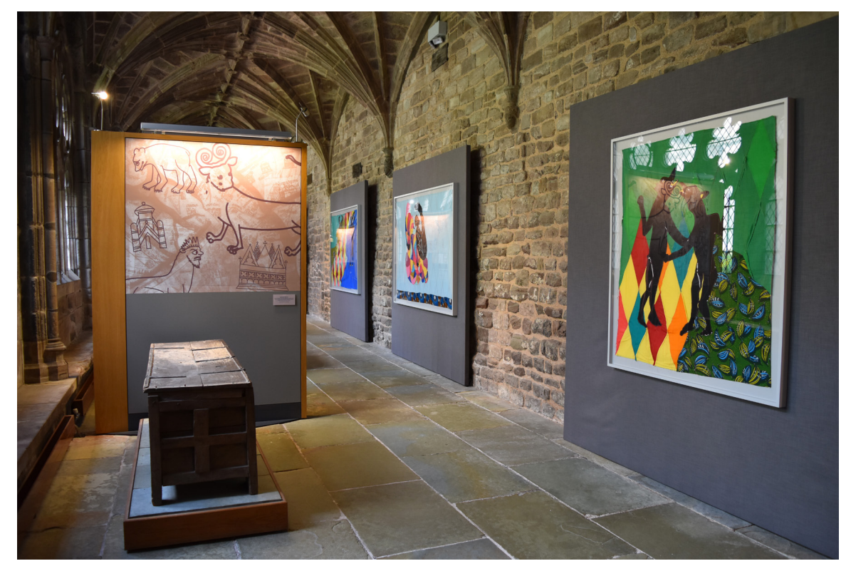
Figure 4. Yinka Shonibare, Creatures of the Mappa Mundi, Gigantes, Monocules, and Alerion and Satyrs, 2018, installation at Hereford Cathedral.

between the medieval map and the contemporary textiles became clear. The map hangs in low light and behind glass, allowing visitors to stand within inches and pore over its details from close proximity. The fifth textile in the exhibition, representing the cicone gentes, or the stork people, was hung on the opposite wall, creating a direct juxtaposition between the map and the textile (Figure 2). Shonibare's works are comparable in size to the Mappa Mundi, and despite their differences in medium, color, and technique, they share an undeniable material quality in the undulation of their surfaces, caused in the textiles by the manner of sewing, and in the map by the wear of time. This is also the moment that the identities of the mysterious beings of Shonibare's textiles are revealed in the map itself: the monoculi of India, the bonnacon of Phrygia, the mandrake of Egypt, for example.