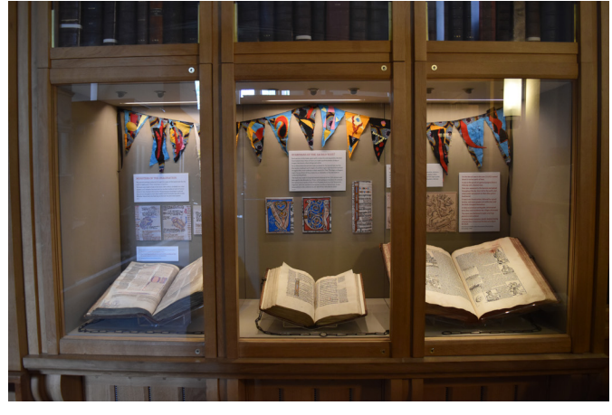
Figure 3. Installation with Dutch-wax bunting in the Chained Library, Hereford Cathedral.

From this display the next room of the exhibition was the Mappa Mundi Gallery itself, where the connections