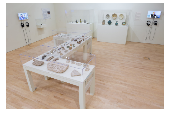
Fragments from the sites of Sijilmasa (Morocco), Tadmekka (Mali), and Gao (Mali) in the exhibition Caravans of Gold.

Sarah Guérin spoke about a complex relay trade in the thirteenth century that sent ivory from sub-Saharan Africa to Northern Europe. Guérin discussed how, over the course of the thirteenth and fourteenth centuries, medieval craftsmen developed an approach to carving that was tailored to this luxury material. She also spoke of the movement