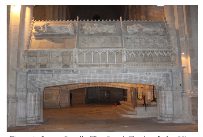
Figure 3. Jaume Cascalls, The Royal Tomb of the Kings of Aragon, Abbey of Santa Maria de Poblet, Catalonia, Spain, Middle of the 14th century-1378.

How did it find its way to the Lipchitz Collection and from there to the Israel Museum? The luxurious pantheon of the royal family was destroyed and looted in 1835 by a crowd who expected to find treasures and jewelry in the coffins. It was finally restored in the mid-twentieth century, and the only original parts saved were some of the statues of mourners that decorated the sides of sarcophagi. The provenance and artistic qualities of the small statue in the museum deserve proper recognition, notes Zur; other figurines looted from the royal pantheon are currently exhibited in the Buddhist Museum in Berlin, the Louvre in Paris, and the Metropolitan in New York.