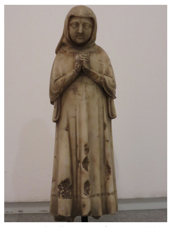
Figure 2. Jaume Cascalls, Mourner / Pleurant, alabaster with traces of gold and paint, The Royal Tomb of the Kings of Aragon, Abbey of Santa Maria de Poblet, Catalonia, Spain, Middle of the 14th century. The Israel Museum.

kings and queens, decorated with statues of funeral processions, including members of diverse social classes who exhibit contemporary mourning practices. Considering the clothing of the small figurine in Jerusalem, labeled "Mourning Monk," Zur determined that it was not a monk nor a member of the clergy, but represents a relative of the deceased, a citizen, or a member of the court. He explored how the installation to which the mourner belonged echoes lay sermons that were much in debate during that period.