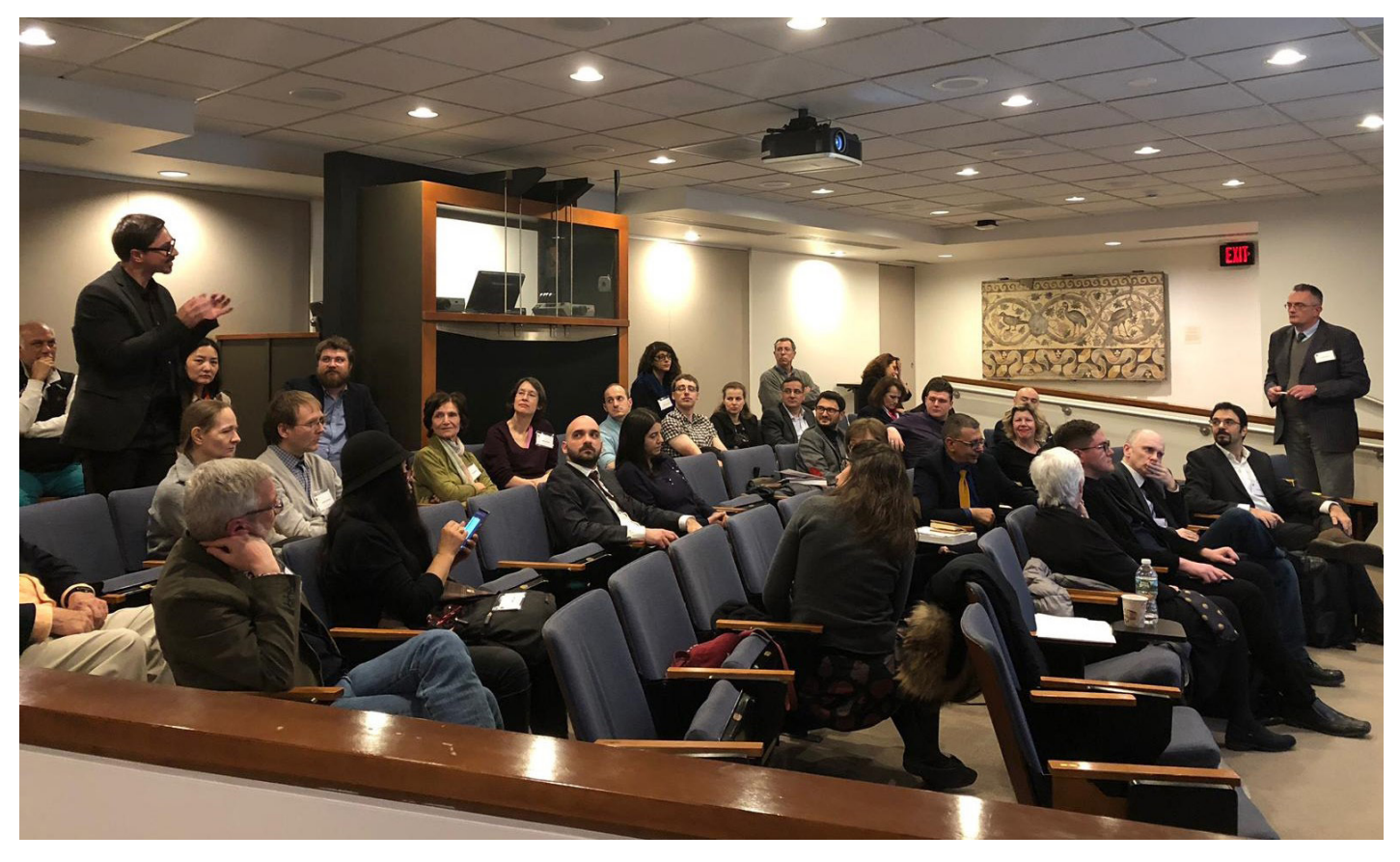
Figure 2. Discussion during the Roundtable Forum at the "Eclecticism at the Edges" Symposium.

event explored the temporal and geographical parameters of the study of medieval art, architecture, and visual culture, seeking to challenge the ways in which we think about the artistic production of Eastern Europe from the fourteenth through the sixteenth centuries. Serbia, Bulgaria, and the Romanian principalities of Wallachia, Moldavia, and Transylvania, among other centers, took on prominent roles in the transmission and appropriation of western medieval, Byzantine, and Slavic artistic traditions, as well as the transformation of the cultural legacy of Byzantium in the later centuries of the empire, and especially in the decades after the fall of Constantinople in 1453.